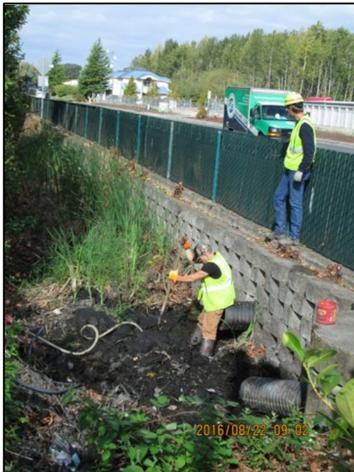
Airport Way/ Bennett Drive retention/ detention pond maintenance