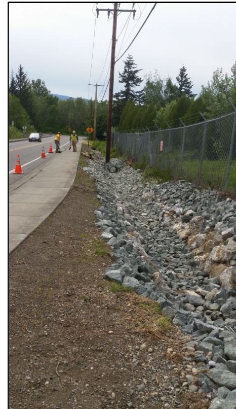
Velocity control and bank stabilization project: Airport Way (adjacent to runway).