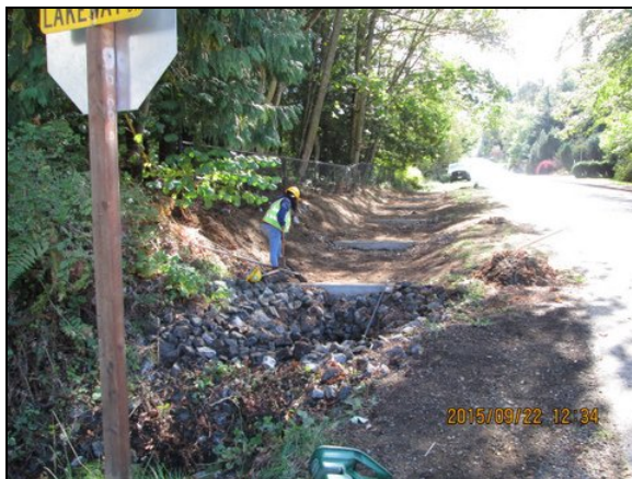
Bioinfiltration swale repair and enhancement at Lakewood Lane and Lakeway Drive (behind Geneva Elementary School)